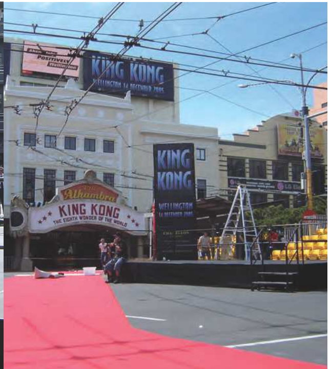
Project: King Kong Premiere, Wellington, New Zealand